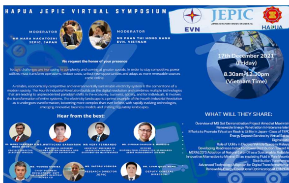
The Webinar Flyer

About 200 (from HAPUA member countries and Japan)